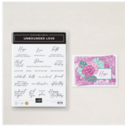
Unbounded Love Photopolymer Stamp Set (English) - 163378 Price: $25.00

Carol Buckalew inkybeestampers@gmail.com https://www.inkybeestampers.com