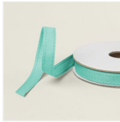
Summer Splash 3/8" (1 Cm) Bordered Ribbon - 163786 Price: $7.50