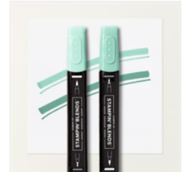
Summer Splash Stampin' Blends Combo Pack - 163826 Price: $11.00