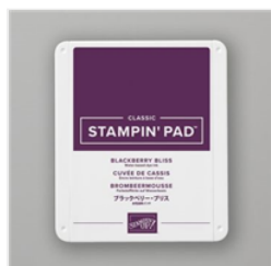
Blackberry Bliss Classic Stampin' Pad - 147092