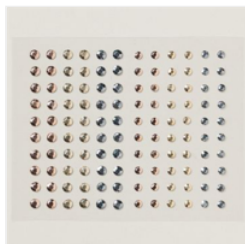
Adhesive-Backed Metallic Gems - 163780