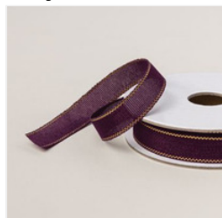
Blackberry Bliss & Gold 1/2" (1.3 Cm) Textured Ribbon - 164039