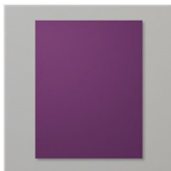
Blackberry Bliss 8-1/2" X 11" Cardstock - 133675