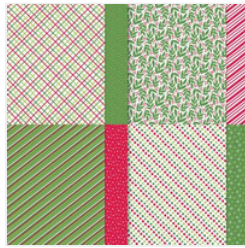
Take A Bow 6" X 6" (15.2 X 15.2 Cm) Designer Series Paper - 164309