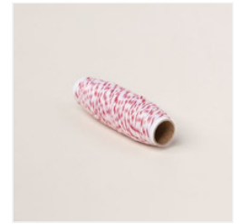
Real Red & White Baker's Twine - 164051