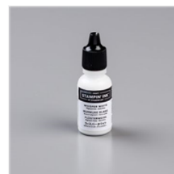
Whisper White Craft Stampin' Ink Refill - 101780