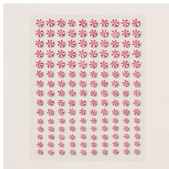
Real Red & White Adhesive-Backed Peppermints - 164050