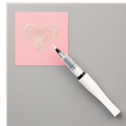
Wink Of Stella Clear Glitter Brush - 141897