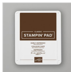
Early Espresso Classic Stampin' Pad - 147114