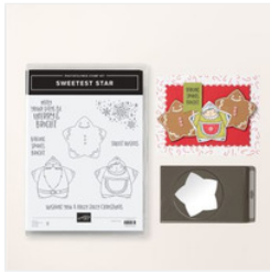
Sweetest Star Bundle (English) - 164098