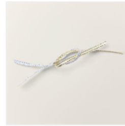
Gold & Silver 1/8" (3.2 Mm) Trim Combo Pack - 161633