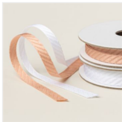
Petal Pink & White 1/4" (6.4 Mm) Diagonal Trim Combo Pack - 163417