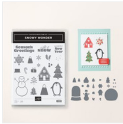
Snowy Wonder Bundle (English) - 164125