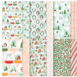
Snowy Scenes 12" X 12" (30.5 X 30.5 Cm) Designer Series Paper - 164333