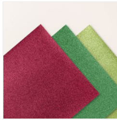
Festive 12" X 12" (30.5 X 30.5 Cm) Glimmer Paper - 164106