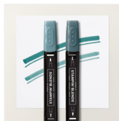
Pretty Peacock Stampin' Blends Combo Pack - 161676