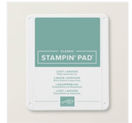
Lost Lagoon Classic Stampin' Pad - 161678