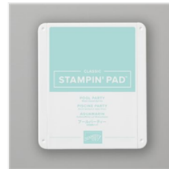
Pool Party Classic Stampin' Pad - 147107