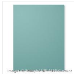
Lost Lagoon 8-1/2" X 11" Cardstock - 133679