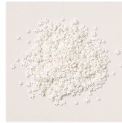
White Loose Snowflakes - 164128