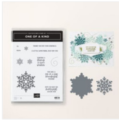
One Of A Kind Bundle (English) - 164078