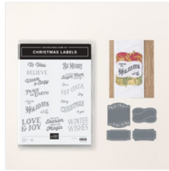
Christmas Labels Bundle (English) - 164101