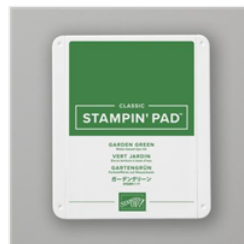
Garden Green Classic Stampin' Pad - 147089