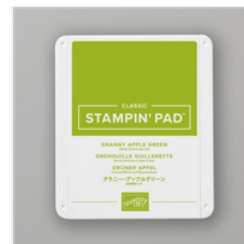
Granny Apple Green Classic Stampin' Pad - 147095