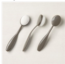
Blending Brushes - 153611