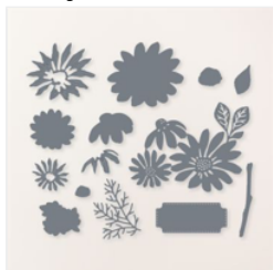
Cheerful Daisies Dies - 161296