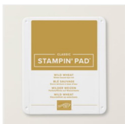
Wild Wheat Classic Stampin' Pad - 161651