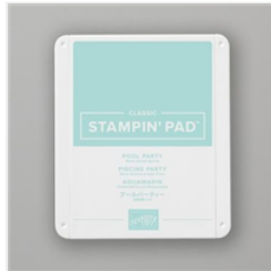
Pool Party Classic Stampin' Pad - 147107