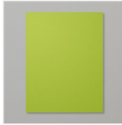
Granny Apple Green 8-1/2\"/>