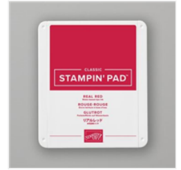
Real Red Classic Stampin' Pad - 147084