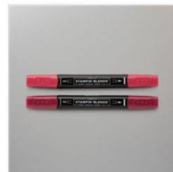
Cherry Cobbler Stampin' Blends Combo Pack - 154880