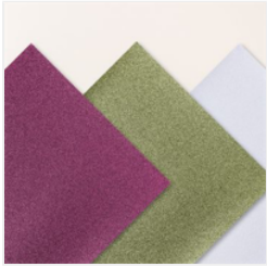
Berry Burst, Old Olive & White 12" X 12" (30.5 X 30.5 Cm) Glimmer Specialty Paper - 163769