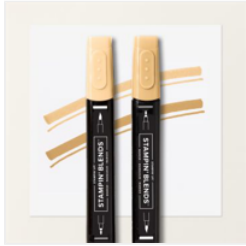
Peach Pie Stampin' Blends Combo Pack - 163827

inkybeestampers@gmail.com https://www.inkybeestampers.com