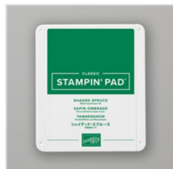
Shaded Spruce Classic Stampin' Pad - 147088