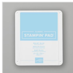
Balmy Blue Classic Stampin' Pad - 147105