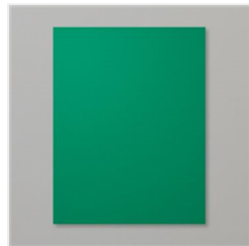
Shaded Spruce 8-1/2" X 11" Cardstock - 146981