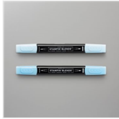
Balmy Blue Stampin' Blends Combo Pack - 154830