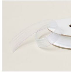
Iridescent 1/2" (1.3 Cm) Striped Trim - 163299