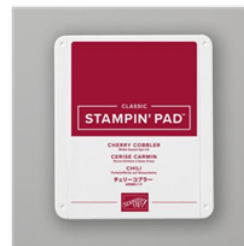
Cherry Cobbler Classic Stampin' Pad - 147083