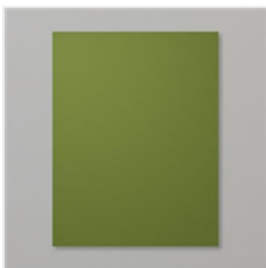
Mossy Meadow 8-1/2" X 11" Cardstock - 133676