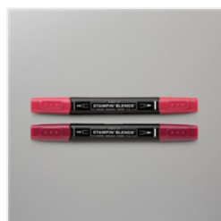
Cherry Cobbler Stampin' Blends Combo Pack - 154880