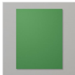
Garden Green 8-1/2" X 11" Cardstock - 102584