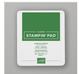
Garden Green Classic Stampin' Pad - 147089