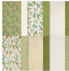
Season Of Green & Gold 12" X 12" (30.5 X 30.5 Cm) Specialty Designer Series Paper - 164324