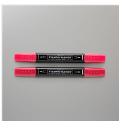
Real Red Stampin' Blends Combo Pack - 154899