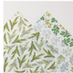
Graceful Greenery Vellum 12" X 12" (30.5 X 30.5 Cm) Specialty Designer Series Paper - 164118