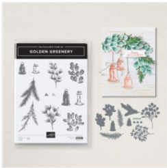
Golden Greenery Bundle - 164117