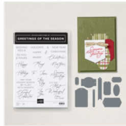
Greetings Of The Season Bundle (English) - 164113