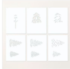
Frosted Forest Decorative Masks - 164350