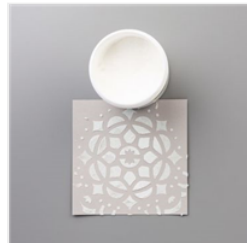
Shimmery White Embossing Paste - 145645