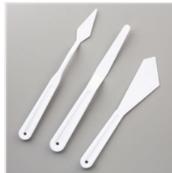
Palette Knives - 142808