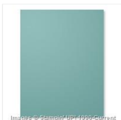
Lost Lagoon 8-1/2" X 11" Cardstock - 133679