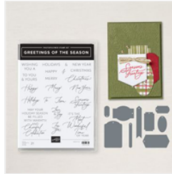
Greetings Of The Season Bundle (English) - 164113