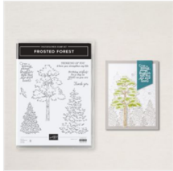
Frosted Forest Photopolymer Stamp Set (English) - 164344

inkybeestampers@gmail.com https://www.inkybeestampers.com