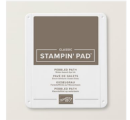
Pebbled Path Classic Stampin' Pad - 161648