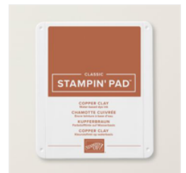
Copper Clay Classic Stampin' Pad - 161647