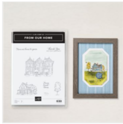
From Our Home Cling Stamp Set (English) - 163680