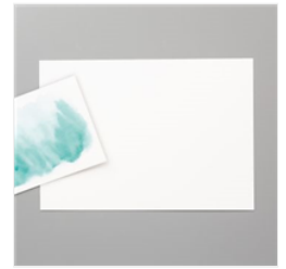
Fluid 100 Watercolor Paper - 149612