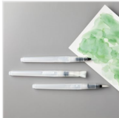
Water Painters - 151298