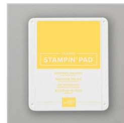
Daffodil Delight Classic Stampin' Pad - 147094