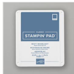
Misty Moonlight Classic Stampin' Pad - 153118