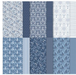
Countryside Inn 12" X 12" (30.5 X 30.5 Cm) Designer Series Paper - 161467