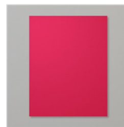
Real Red 8-1/2" X 11" Cardstock - 102482