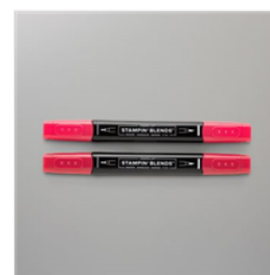
Real Red Stampin' Blends Combo Pack - 154899