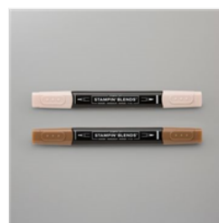
Bronze & Ivory Stampin' Blends Combo Pack - 154922