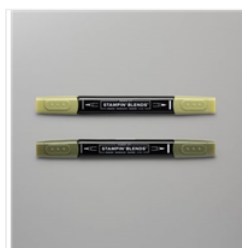
Mossy Meadow Stampin' Blends Combo Pack - 154890