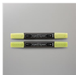
Granny Apple Green Stampin' Blends Combo Pack - 154885