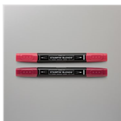
Cherry Cobbler Stampin' Blends Combo Pack - 154880