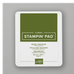
Mossy Meadow Classic Stampin' Pad - 147111