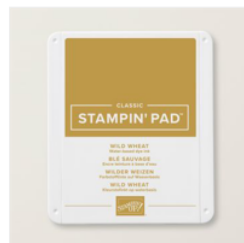
Wild Wheat Classic Stampin' Pad - 161651