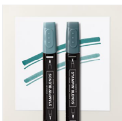
Pretty Peacock Stampin' Blends Combo Pack - 161676