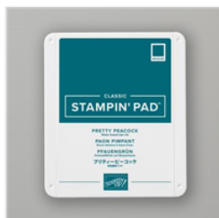
Pretty Peacock Classic Stampin' Pad - 150083