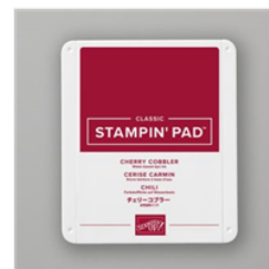
Cherry Cobbler Classic Stampin' Pad - 147083