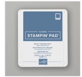
Misty Moonlight Classic Stampin' Pad - 153118