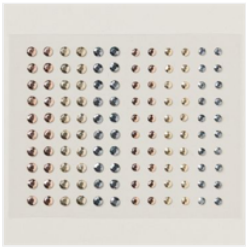
Adhesive-Backed Metallic Gems - 163780