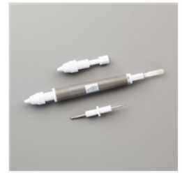
Take Your Pick - 144107