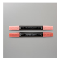
Calypso Coral Stampin' Blends Combo Pack - 154881