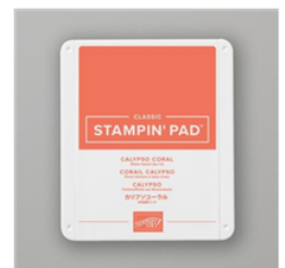
Calypso Coral Classic Stampin' Pad - 147101