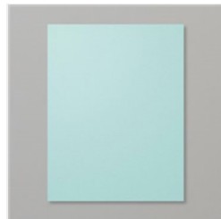
Pool Party 8-1/2" X 11" Cardstock - 122924