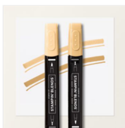
Peach Pie Stampin' Blends Combo Pack - 163827