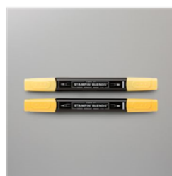
Daffodil Delight Stampin' Blends Combo Pack - 154883