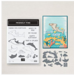
Friendly Fins Bundle (English) - 163589