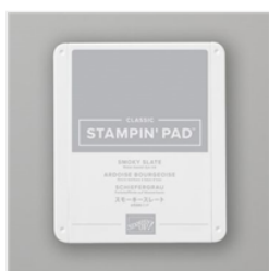
Smoky Slate Classic Stampin' Pad - 147113