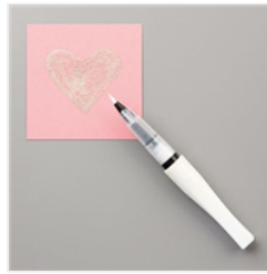
Wink Of Stella Clear Glitter Brush - 141897