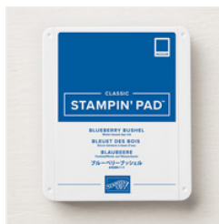
Blueberry Bushel Classic Stampin' Pad - 147138