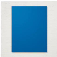
Blueberry Bushel 8-1/2" X 11" Cardstock - 146968