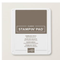
Pebbled Path Classic Stampin' Pad - 161648