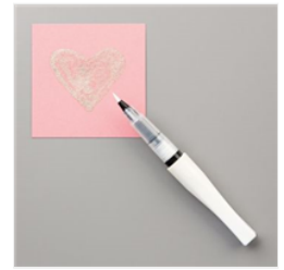
Wink Of Stella Clear Glitter Brush - 141897