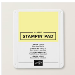
Lemon Lolly Classic Stampin' Pad - 161666