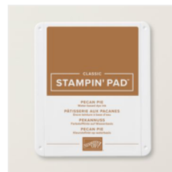
Pecan Pie Classic Stampin' Pad - 161665