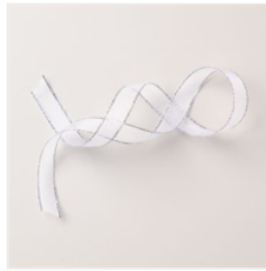
Silver & White 1/2" (1.3 Cm) Sheer Ribbon - 162149