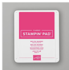
Melon Mambo Classic Stampin' Pad - 147051