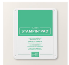
Shy Shamrock Classic Stampin' Pad - 163808