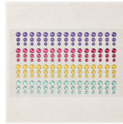
Glossy Dots Assortment - 158827