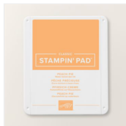
Peach Pie Classic Stampin' Pad - 163810