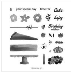
Cake Fancy Photopolymer Stamp Set (English) - 162932