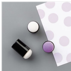
Sponge Daubers - 133773