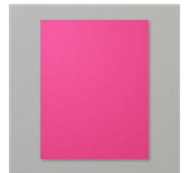
Melon Mambo 8- 1/2" X 11" Cardstock - 115320