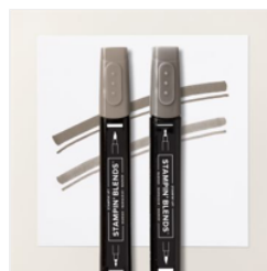
Pebbled Path Stampin' Blends Combo Pack - 161658