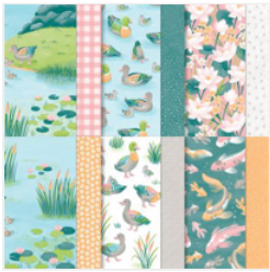
Lily Pond Lane 6" X 6" (15.2 X 15.2 Cm) Designer Series Paper - 163342