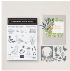
Charming Duck Pond Bundle (English) - 163350