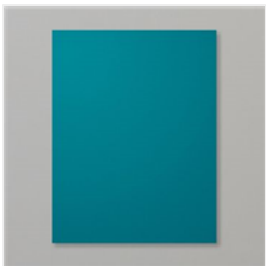
Pretty Peacock 8-1/2" X 11" Cardstock - 150880