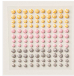
Adhesive-Backed Dappled Dots - 163353