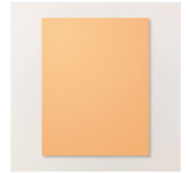
Peach Pie 8-1/2" X 11" Cardstock - 163799