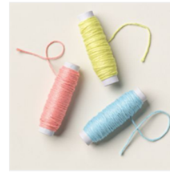
Baker's Twine Three Color Pack - 162759