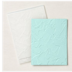
Painted Texture 3D Embossing Folder - 154317