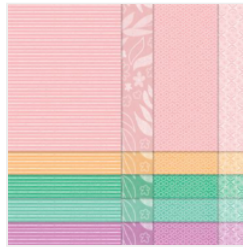
2024-2026 In Color™ 6" X 6" (15.2 X 15.2 Cm) Designer Series Paper - 163777