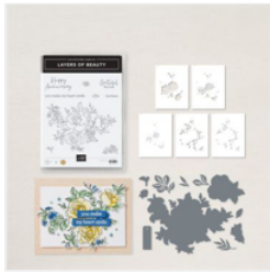
Layers Of Beauty Bundle (English) - 163519