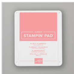
Flirty Flamingo Classic Stampin' Pad - 147052