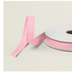
Pretty In Pink 3/8" (1 Cm) Bordered Ribbon - 163784