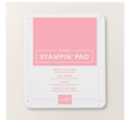
Pretty In Pink Classic Stampin Pad - 163807