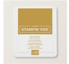
Wild Wheat Classic Stampin' Pad - 161651