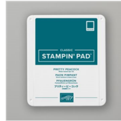
Pretty Peacock Classic Stampin' Pad - 150083