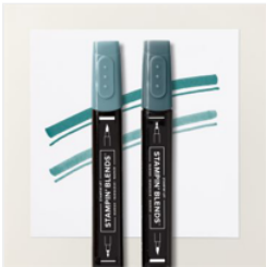
Pretty Peacock Stampin' Blends Combo Pack - 161676