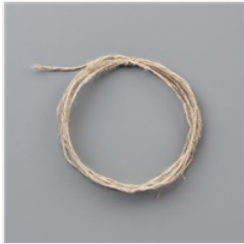
Linen Thread - 104199