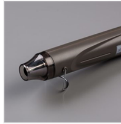
Heat Tool - 129053