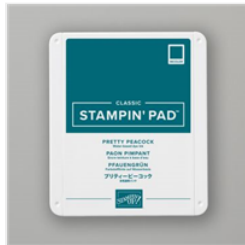
Pretty Peacock Classic Stampin' Pad - 150083