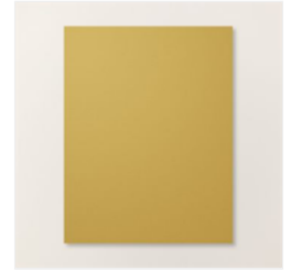
Wild Wheat 8-1/2" X 11" Cardstock - 161725