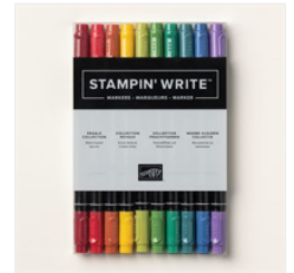
Regals Stampin' Write Markers - 161699