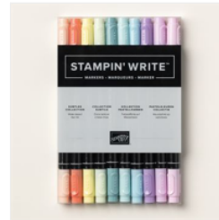
Subtles Stampin' Write Markers - 161698