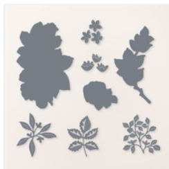
Stippled Roses Dies - 162666