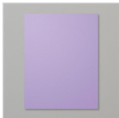
Highland Heather 8-1/2" X 11" Cardstock - 146986