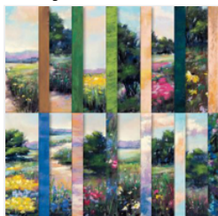
Meandering Meadows 6" X 6" (15.2 X 15.2 Cm) Designer Series Paper - 162735

inkybeestampers@gmail.com https://www.inkybeestampers.com