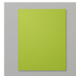
Granny Apple Green 8-1/2" X 11" Cardstock - 146990