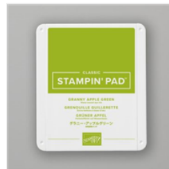
Granny Apple Green Classic Stampin' Pad - 147095