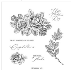
Stippled Roses Cling Stamp Set (English) - 162657