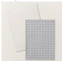
Cane Weave 3D Embossing Folder - 160580

inkybeestampers@gmail.com https://www.inkybeestampers.com