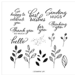
Layering Leaves Photopolymer Stamp Set (English) - 161277