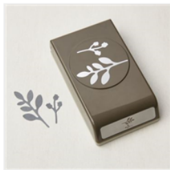
Bough Punch - 157711