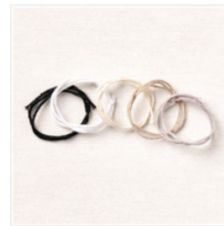
Baker's Twine Essentials Pack - 155475