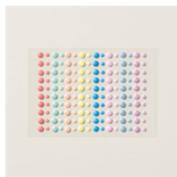
Rainbow Adhesive-Backed Dots - 162758