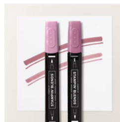
Moody Mauve Stampin' Blends Combo Pack - 161660