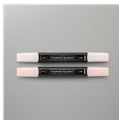
Petal Pink Stampin' Blends Combo Pack - 154893