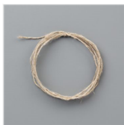
Linen Thread - 104199