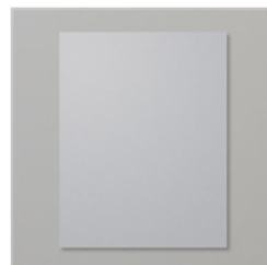
Smoky Slate 8-1/2" X 11" Cardstock - 131202