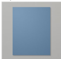
Misty Moonlight 8- 1/2" X 11" Cardstock - 153081