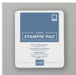
Misty Moonlight Classic Stampin' Pad - 153118