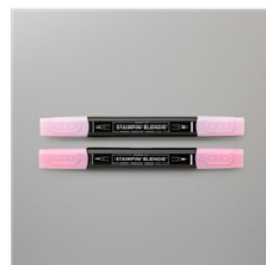
Flirty Flamingo Stampin' Blends Combo Pack - 154884