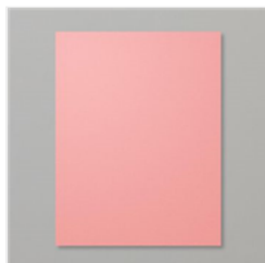
Flirty Flamingo 8- 1/2" X 11" Cardstock - 141416