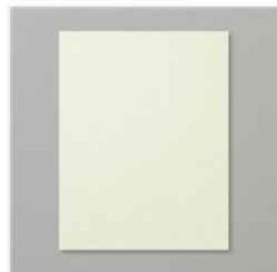
Soft Sea Foam 8- 1/2" X 11" Cardstock - 146988