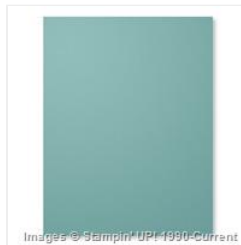
Lost Lagoon 8-1/2" X 11" Cardstock - 133679