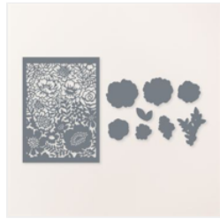
Two-Tone Flora Dies - 159181