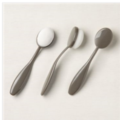
Blending Brushes - 153611