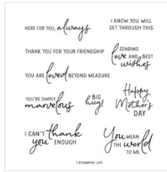
Perennial Postage Cling Stamp Set (English) - 162598