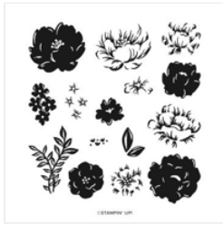
Two-Tone Flora Photopolymer Stamp Set - 160844