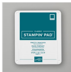
Pretty Peacock Classic Stampin' Pad - 150083