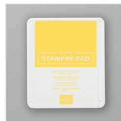
Daffodil Delight Classic Stampin' Pad - 147094