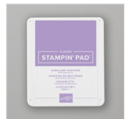
Highland Heather Classic Stampin' Pad - 147103