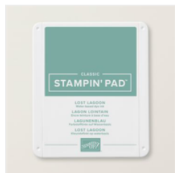
Lost Lagoon Classic Stampin' Pad - 161678