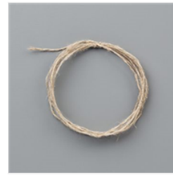
Linen Thread - 104199