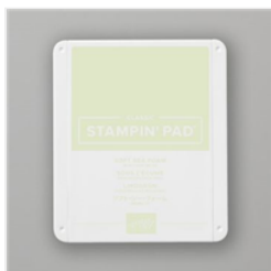
Soft Sea Foam Classic Stampin' Pad - 147102