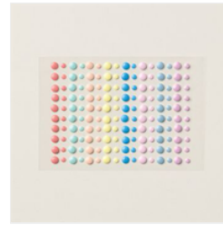
Rainbow Adhesive-Backed Dots - 162758