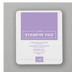
Highland Heather Classic Stampin' Pad - 147103