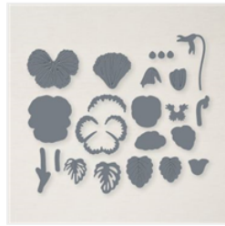
Pansy Dies - 155680