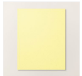
Lemon Lolly 8-1/2" X 11" Cardstock - 161720