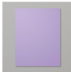
Highland Heather 8-1/2" X 11" Cardstock - 146986