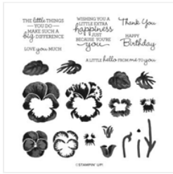
Pansy Patch Photopolymer Stamp Set (English) - 154999