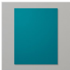
Pretty Peacock 8-1/2" X 11" Cardstock - 150880