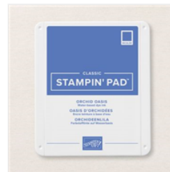
Orchid Oasis Classic Stampin' Pad - 159214