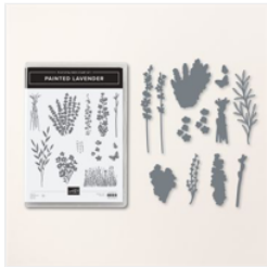
Painted Lavender Bundle - 162597

inkybeestampers@gmail.com https://www.inkybeestampers.com