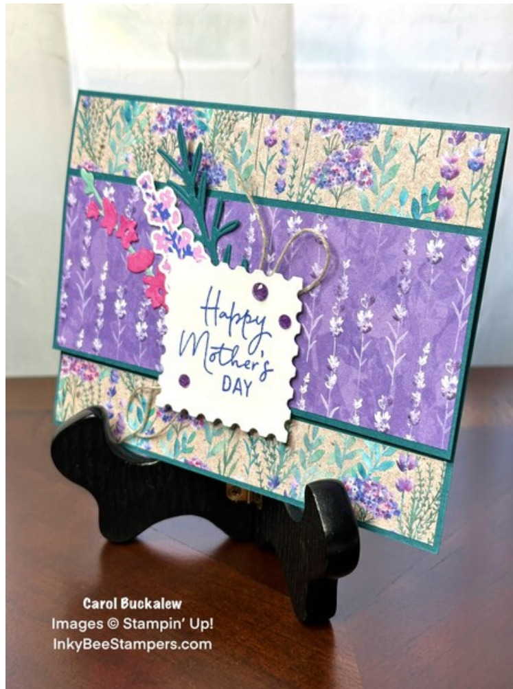
Carol Buckalew Images © Stampin' Up! InkyBeeStampers.com

I used the Painted Lavendar Bundle and Perennial Postage Bundle along with the Perennial Lavender 12" x 12" Designer Series Paper to create this pretty Mother's Day card! This is a simple fun fold that can be used in either portrait or landscape orientation...making it a versatile fold. Let's take a look!