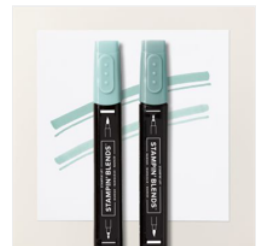
Lost Lagoon Stampin' Blends Combo Pack - 161680