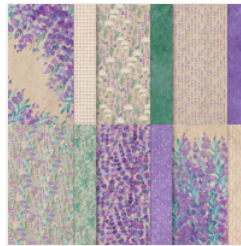
Perennial Lavender 12" X 12" (30.5 X 30.5 Cm) Designer Series Paper - 162593