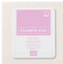
Fresh Freesia Classic Stampin' Pad - 155611