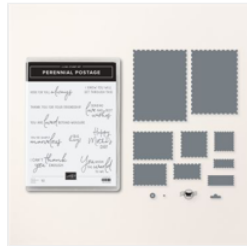
Perennial Postage Bundle (English) - 162608