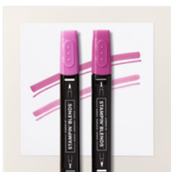
Berry Burst Stampin' Blends Combo Pack - 161681