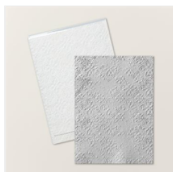
Distressed Tile 3D Embossing Folder - 162189