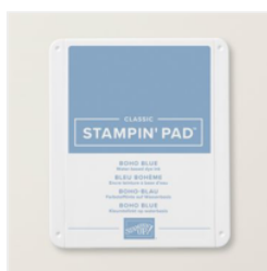
Boho Blue Classic Stampin' Pad - 161650