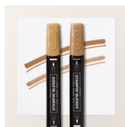
Pecan Pie Stampin' Blends Combo Pack - 161674