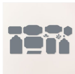
Something Fancy Dies - 160424