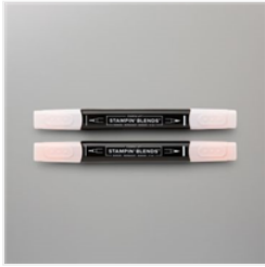
Petal Pink Stampin' Blends Combo Pack - 154893

inkybeestampers@gmail.com https://www.inkybeestampers.com