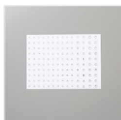
Rhinestone Basic Jewels - 144220