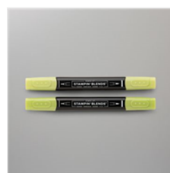
Granny Apple Green Stampin' Blends Combo Pack - 154885