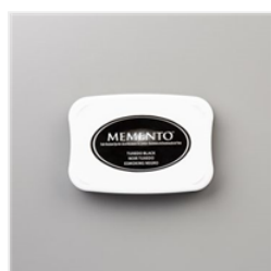
Tuxedo Black Memento Ink Pad - 132708