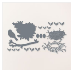
Nested Friends Dies - 160488