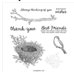
Nested Friends Cling Stamp Set (English) - 160322