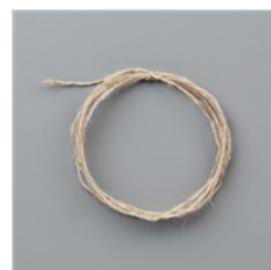
Linen Thread - 104199