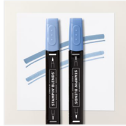
Boho Blue Stampin' Blends Combo Pack - 161659