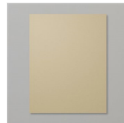
Crumb Cake 8-1/2" X 11" Cardstock - 120953