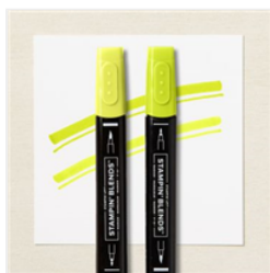
Parakeet Party Stampin' Blends Combo Pack - 159220