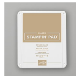
Crumb Cake Classic Stampin' Pad - 147116