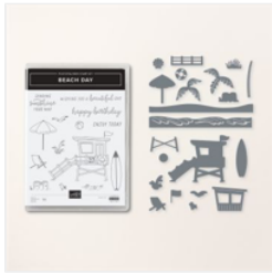
Beach Day Bundle (English) - 162800