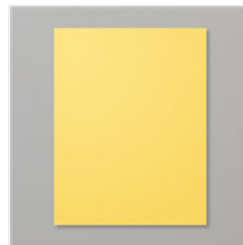
Daffodil Delight 8- 1/2" X 11" Cardstock - 119683