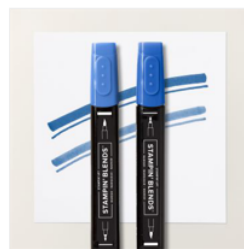
Blueberry Bushel Stampin' Blends Combo Pack - 161679