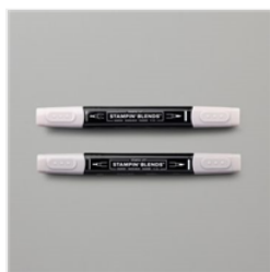
Gray Granite Stampin' Blends Combo Pack - 154886