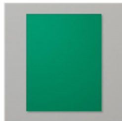
Shaded Spruce 8- 1/2" X 11" Cardstock - 146981