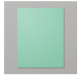
Coastal Cabana 8- 1/2" X 11" Cardstock - 131297