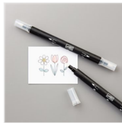
Blender Pens - 102845