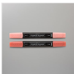
Calypso Coral Stampin' Blends Combo Pack - 154881