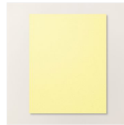
Lemon Lolly 8-1/2" X 11" Cardstock - 161720