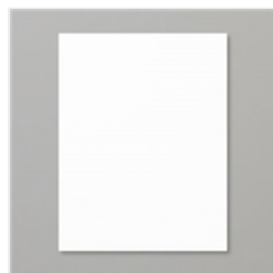
Basic White 8-1/2" X 11" Cardstock - 159276