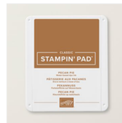
Pecan Pie Classic Stampin' Pad - 161665