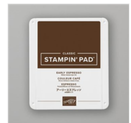
Early Espresso Classic Stampin' Pad - 147114