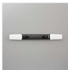
Stampin' Blends Color Lifter - 144608