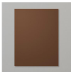
Early Espresso 8- 1/2" X 11" Cardstock - 119686