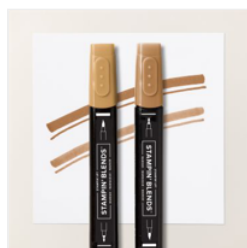
Pecan Pie Stampin' Blends Combo Pack - 161674