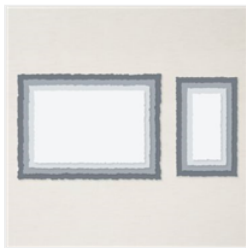
Deckled Rectangles Dies - 159173