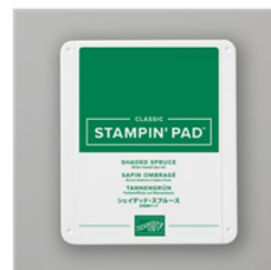
Shaded Spruce Classic Stampin' Pad - 147088