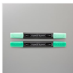
Shaded Spruce Stampin' Blends Combo Pack - 154903