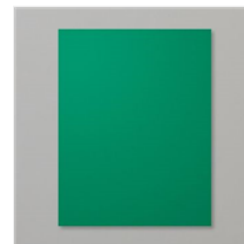
Shaded Spruce 8- 1/2" X 11" Cardstock - 146981