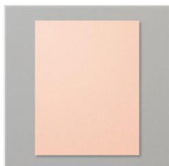
Petal Pink 8-1/2" X 11" Cardstock - 146985