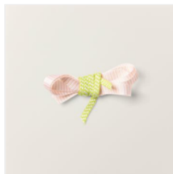
Ribbon Duo Combo Pack - 161318