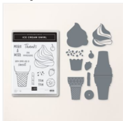
Ice Cream Swirl Bundle (English) - 162771