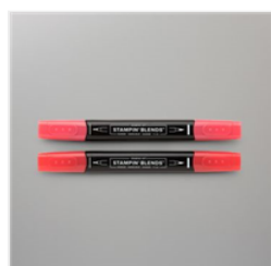
Poppy Parade Stampin' Blends Combo Pack - 154958