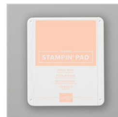
Petal Pink Classic Stampin' Pad - 147108