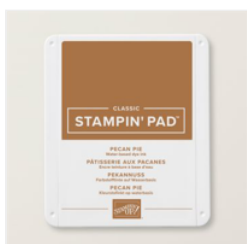
Pecan Pie Classic Stampin' Pad - 161665