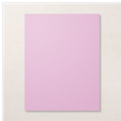
Fresh Freesia 8- 1/2" X 11" Cardstock - 155613