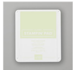
Soft Sea Foam Classic Stampin' Pad - 147102