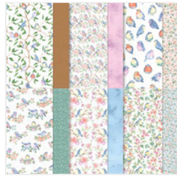
Flight & Airy 12" X 12" (30.5 X 30.5 Cm) Designer Series Paper - 162977