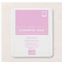
Fresh Freesia Classic Stampin' Pad - 155611