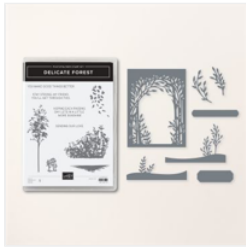
Delicate Forest Bundle (English) - 162680