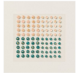
Petal Pink & Pretty Peacock Foiled Gems - 162587