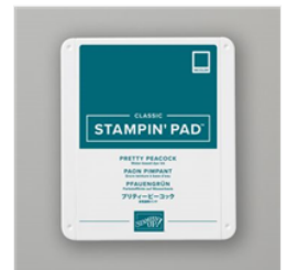
Pretty Peacock Classic Stampin' Pad - 150083