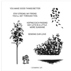
Delicate Forest Photopolymer Stamp Set (English) - 162675