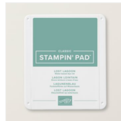
Lost Lagoon Classic Stampin' Pad - 161678