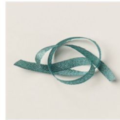
Pretty Peacock & Gold 3/8" (1 Cm) Metallic Ribbon - 162588