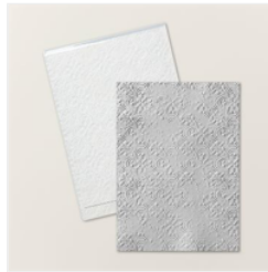
Distressed Tile 3D Embossing Folder - 162189