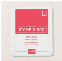
Sweet Sorbet Classic Stampin' Pad - 159216