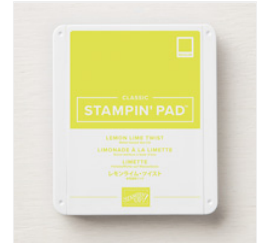
Lemon Lime Twist Classic Stampin' Pad - 147145