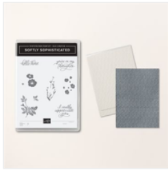
Softly Sophisticated Bundle (English) - 162947