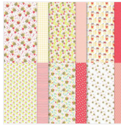
Bee Mine 12" X 12" (30.5 X 30.5 Cm) Designer Series Paper - 162546