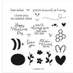
Bee My Valentine Photopolymer Stamp Set (English) - 162547