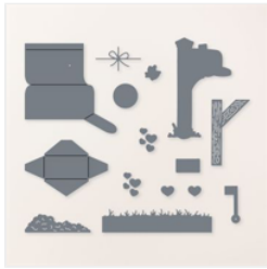
Sending Love Dies - 162879