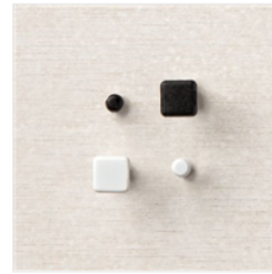
Round & Square Brads - 155570