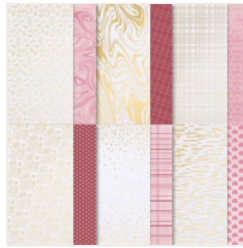
Most Adored 12" X 12" (30.5 X 30.5 Cm) Specialty Designer Series Paper - 162976