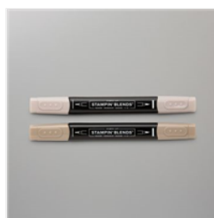
Crumb Cake Stampin' Blends Combo Pack - 154882