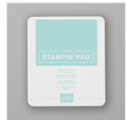
Pool Party Classic Stampin' Pad - 147107