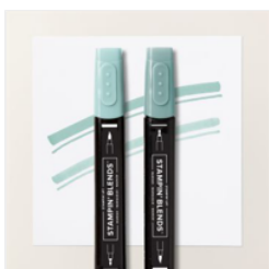
Lost Lagoon Stampin' Blends Combo Pack - 161680