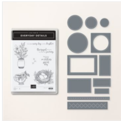
Everyday Details Bundle - 162865