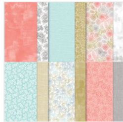
Softly Stippled 12" X 12" (30.5 X 30.5 Cm) Designer Series Paper - 162975