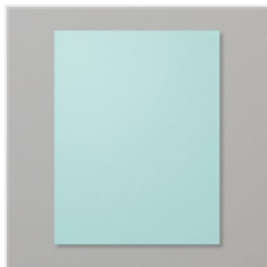
Pool Party 8-1/2" X 11" Cardstock - 122924