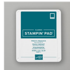
Pretty Peacock Classic Stampin' Pad - 150083