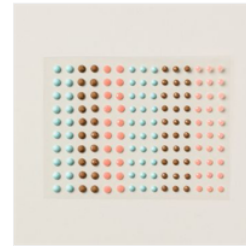
Opaque Faceted Gems - 162979