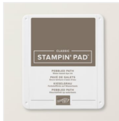
Pebbled Path Classic Stampin' Pad - 161648