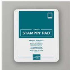
Pretty Peacock Classic Stampin' Pad - 150083