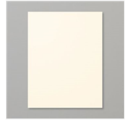
Very Vanilla 8-1/2" X 11" Cardstock - 101650