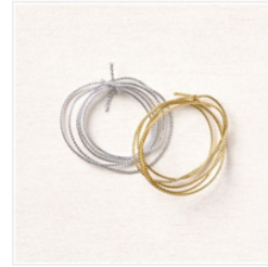
Simply Elegant Trim - 155766