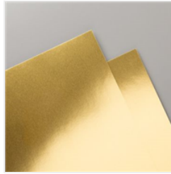
Gold Foil Sheets - 132622