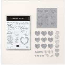
Adoring Hearts Bundle (English) - 162570