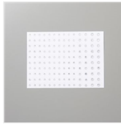
Rhinestone Basic Jewels - 144220