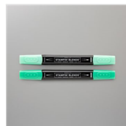
Shaded Spruce Stampin' Blends Combo Pack - 154903