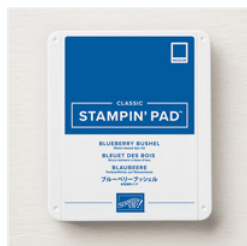
Blueberry Bushel Classic Stampin' Pad - 147138