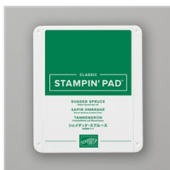
Shaded Spruce Classic Stampin' Pad - 147088