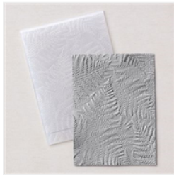
Fern 3D Embossing Folder - 158804