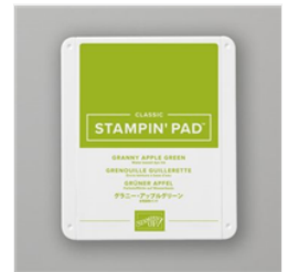
Granny Apple Green Classic Stampin' Pad - 147095