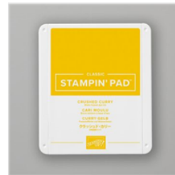
Crushed Curry Classic Stampin' Pad - 147087