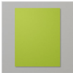
Granny Apple Green 8-1/2" X 11" Cardstock - 146990