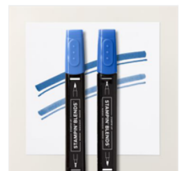
Blueberry Bushel Stampin' Blends Combo Pack - 161679