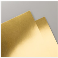
Gold Foil Sheets - 132622