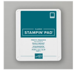
Pretty Peacock Classic Stampin' Pad - 150083