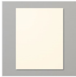
Very Vanilla 8-1/2" X 11" Cardstock - 101650