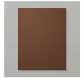
Early Espresso 8- 1/2" X 11" Cardstock - 119686