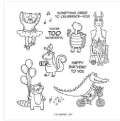
Zany Zoo Cling Stamp Set (English) - 161305