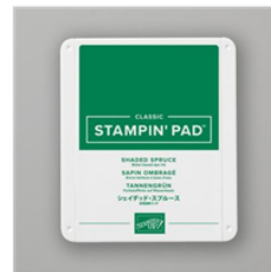
Shaded Spruce Classic Stampin' Pad - 147088