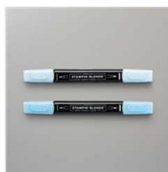
Balmy Blue Stampin' Blends Combo Pack - 154830