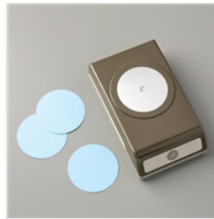
2" (5.1 Cm) Circle Punch - 133782