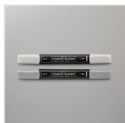
Smoky Slate Stampin' Blends Combo Pack - 154904