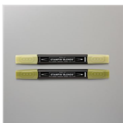
Old Olive Stampin' Blends Combo Pack - 154892