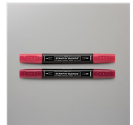
Cherry Cobbler Stampin' Blends Combo Pack - 154880