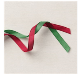
Real Red & Garden Green 3/8" (1 Cm) Ribbon Combo Pack - 159577