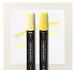
Lemon Lolly Stampin' Blends Combo Pack - 161673