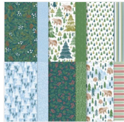
A Walk In The Forest 12" X 12" (30.5 X 30.5 Cm) Designer Series Paper - 162377