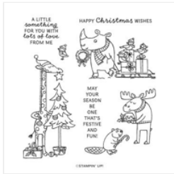
Festive & Fun Cling Stamp Set (English) - 162078