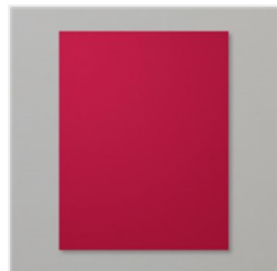
Cherry Cobbler 8-1/2" X 11" Cardstock - 119685