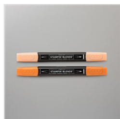
Pumpkin Pie Stampin' Blends Combo Pack - 154897