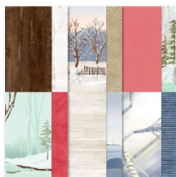
One Horse Open Sleigh 6" X 6" (15.2 X 15.2 Cm) Designer Series Paper - 162118