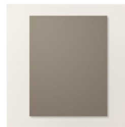
Pebbled Path 8- 1/2" X 11" Cardstock - 161722