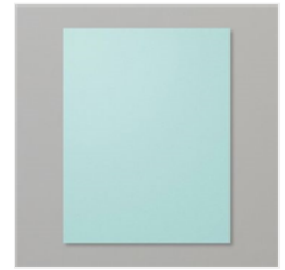
Pool Party 8-1/2" X 11" Cardstock - 122924