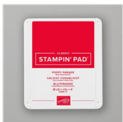
Poppy Parade Classic Stampin' Pad - 147050