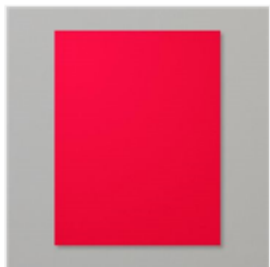
Poppy Parade 8- 1/2" X 11" Cardstock - 119793