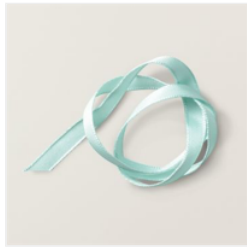
Pool Party 3/8" (1 Cm) Grosgrain Ribbon - 160430