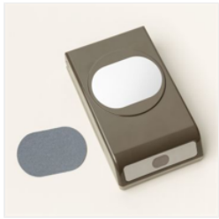
Modern Oval Punch - 162234