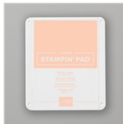
Petal Pink Classic Stampin' Pad - 147108