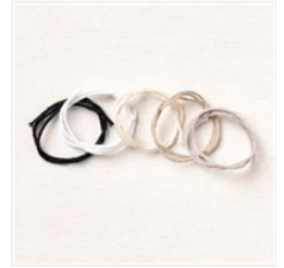
Baker's Twine Essentials Pack - 155475