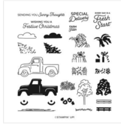
Trucking Along Photopolymer Stamp Set (English) - 162299