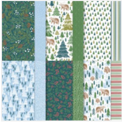
A Walk In The Forest 12" X 12" (30.5 X 30.5 Cm) Designer Series Paper - 162377