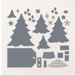
Merriest Trees Dies - 162047