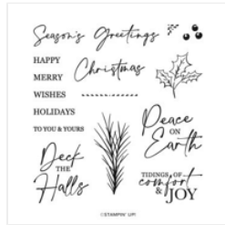
Christmas Classics Photopolymer Stamp Set (English) - 161970