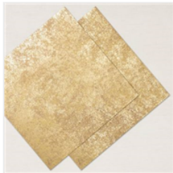
Distressed Gold 12" X 12" (30.5 X 30.5 Cm) Specialty Paper - 159237