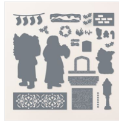
Saint Nicholas Dies - 162352