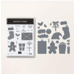
Sending Cheer Bundle (English) - 162053

inkybeestampers@gmail.com https://www.inkybeestampers.com