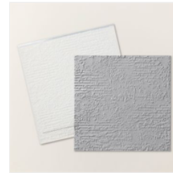
Exposed Brick 3D Embossing Folder - 161600