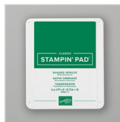
Shaded Spruce Classic Stampin' Pad - 147088