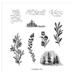
Magical Meadow Cling Stamp Set (English) - 162134