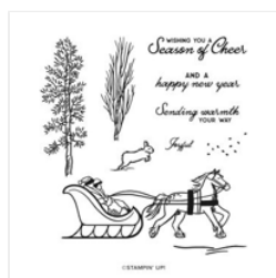
Horse & Sleigh Photopolymer Stamp Set (English) - 162119