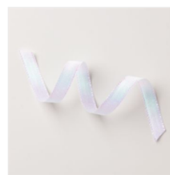
White 1/2" (1.3 Cm) Iridescent Ribbon - 161955