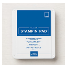
Blueberry Bushel Classic Stampin' Pad - 147138