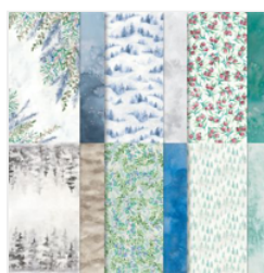
Winter Meadow 12" X 12" (30.5 X 30.5 Cm) Designer Series Paper - 162133