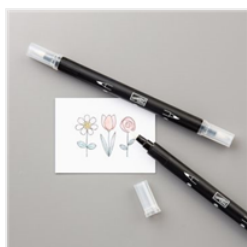
Blender Pens - 102845