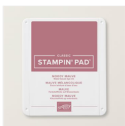
Moody Mauve Classic Stampin' Pad - 161649