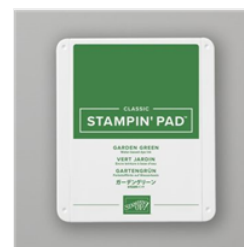
Garden Green Classic Stampin' Pad - 147089