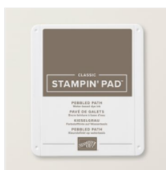
Pebbled Path Classic Stampin' Pad - 161648