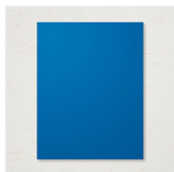
Blueberry Bushel 8-1/2" X 11" Cardstock - 146968