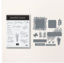
Christmas Classics Bundle (English) - 161977