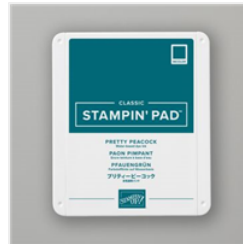
Pretty Peacock Classic Stampin' Pad - 150083