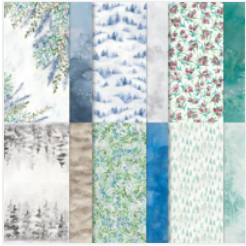
Winter Meadow 12" X 12" (30.5 X 30.5 Cm) Designer Series Paper - 162133