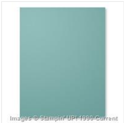
Lost Lagoon 8-1/2" X 11" Cardstock - 133679