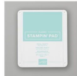
Pool Party Classic Stampin' Pad - 147107