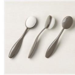
Blending Brushes - 153611