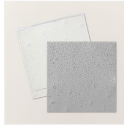
Snowflake Sky 3D Embossing Folder - 162026