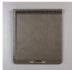
Simply Scored Scoring Tool - 122334